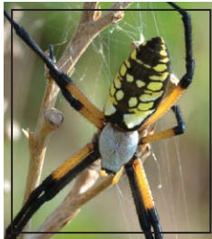
BLACK & YELLOW GARDEN

Check to see if the leg span of the spider is about two and a half inches long, and look for yellow and black markings with a white area near the head. If your spider fits this description, it is likely to be a Black and Yellow Garden spider. Bites result in only mild itching and swelling for a couple days, though it is believed their bites could inject a very small amount of neurotoxin as well.