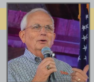
GDA Commissioner & 2022 U.S. Senate Candidate Gary W. Black